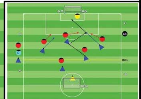
More Challenging Activity