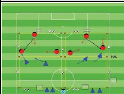
Less Challenging Activity