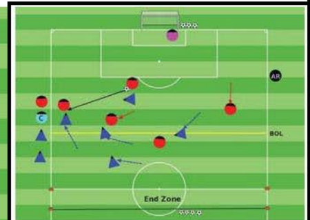
More Challenging Activity