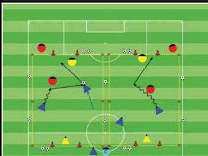
Less Challenging Activity