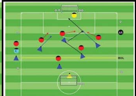
More Challenging Activity